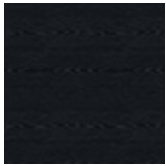
fr73 open pore matt black ashwood