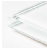
extra clear frosted glass white painted