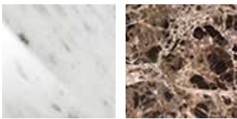
BC polished white Carrara