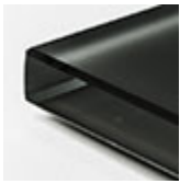
extra clear frosted glass black painted