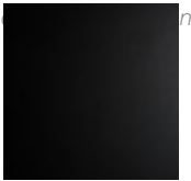
OP17 matt black