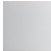
GFM71 white embossed