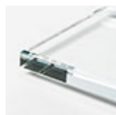
extra light transparent