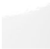
L7 polished white lacquered