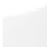
L7 polished white lacquered