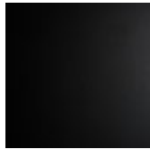
OP17 matt black