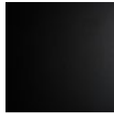
OP17 matt black