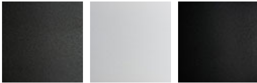
GFM69 graphite embossed