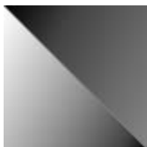
bevelled extra clear