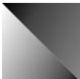
bevelled extra clear