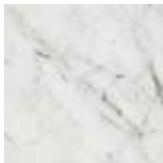
BCO matt white Carrara