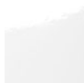
L7 polished white lacquered