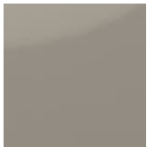
L5 polished oyster lacquered