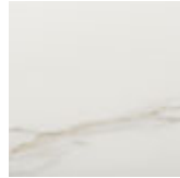
KM05 Golden Calacatta mate