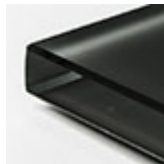
cristal extraclaro translúcido barnizado negro