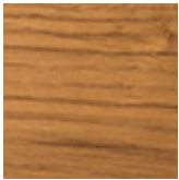
HR roble Heritage