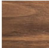
NC nogal canaletto