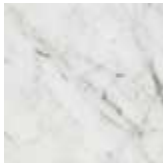
BCO blanco Carrara mate