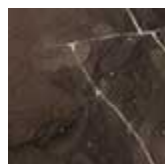
EBO Ebanó mate