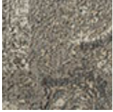
algodón y felpa Chennai