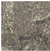
algodón y felpa Chennai