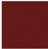
89 ROSSO CORSA