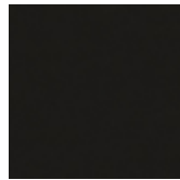
91 TESTA DI MORO