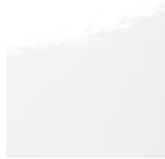
L7 lacado blanco brillo