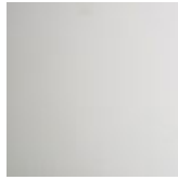
OP71 blanco mate