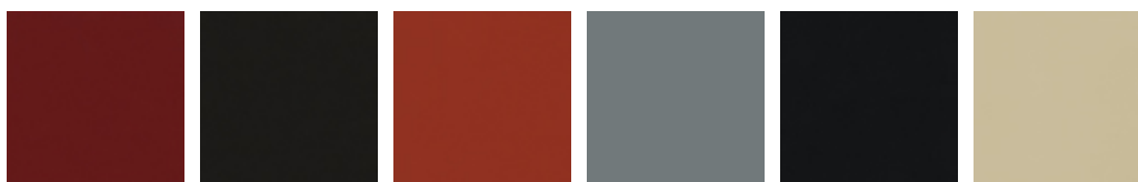
89 ROSSO CORSA