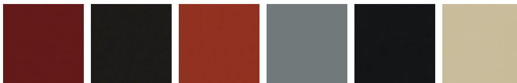
89 ROSSO CORSA