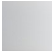
GFM71 gofrado blanco