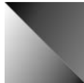
grafito extra claro