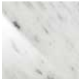
BC blanco Carrara brillo