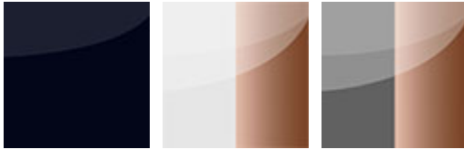
azul de cobalto