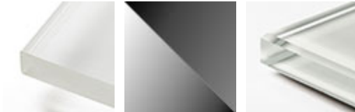
blanco extra claro