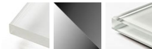
blanco extra claro