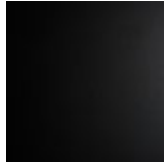
OP17 negro mate