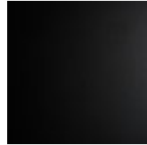
OP17 negro mate