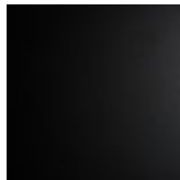
OP17 negro mate