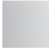
GFM71 gofrado blanco