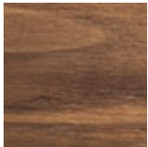
NC nogal canaletto