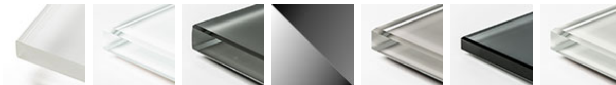
blanco extra claro