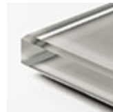
grey extra claro