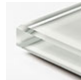
oyster extra claro