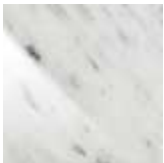
BC blanco Carrara brillo