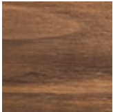
NC nogal canaletto