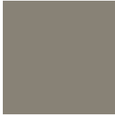
OP30 grey mate