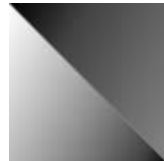
grafito extra claro