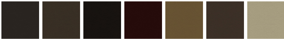
891 TESTA DI MORO