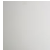
OP71 blanco mate