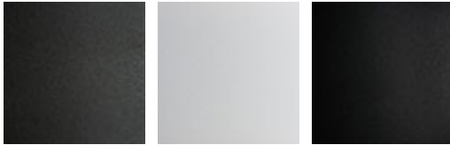
GFM69 gofrado graphite