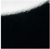
L3 lacado negro brillo