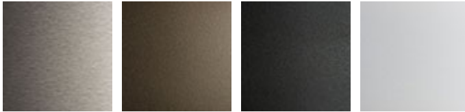
acero inox satinado