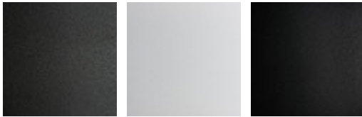
GFM69 gofrado graphite