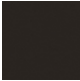
941 TESTA DI MORO