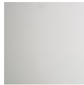
OP71 blanco mate