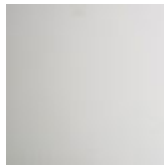
OP71 blanco mate