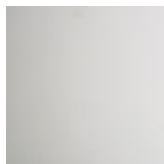
OP71 blanco mate