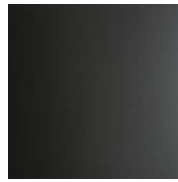
OP69 graphite mate