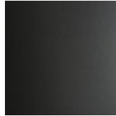
OP69 graphite mate