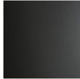
0P69 graphite mate