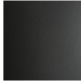
OP69 graphite mate