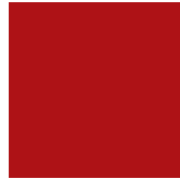
OP89 rojo corsa