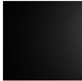
0P17 negro mate