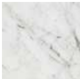
BCO blanco Carrara mate