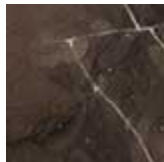
EBO Ebano mate