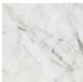
BCO blanco Carrara mate