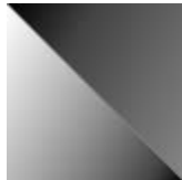
transparente extraclaro biselado