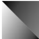
transparente extraclaro biselado