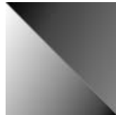
transparente extraclaro biselado