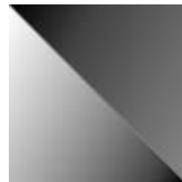
transparente extraclaro biselado