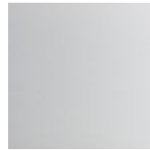
GFM71 gofrado blanco