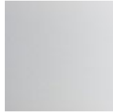
GFM71 gofrado blanco