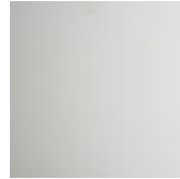
OP71 blanco mate