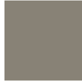
OP30 grey mate