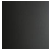
OP69 graphite mate