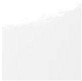
L7 lacado blanco brillo