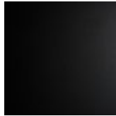
OP17 negro mate