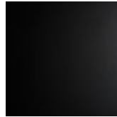
OP17 negro mate