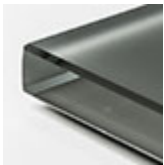
cristal extraclaro translúcido barnizado