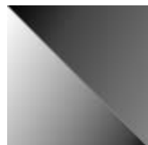
grafito extra claro