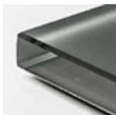
cristal extraclaro translúcido barnizado