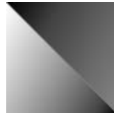
grafito extra claro