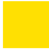
OP86 amarillo mate