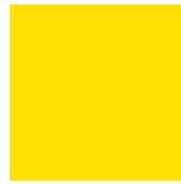
OP86 amarillo mate