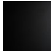
OP17 negro mate