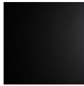
OP17 negro mate