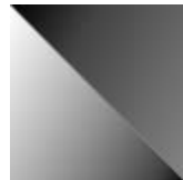
transparente extraclaro biselado