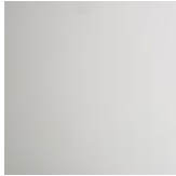
OP71 blanco mate