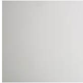
0P71 blanco mate